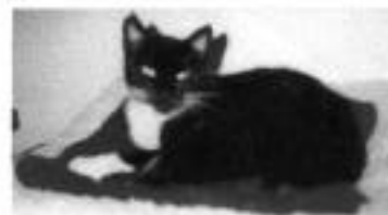
Shadow enjoys her Snuggie.

Snugglies, also known as Purr-pads, are mini-afghans made for all the cats & kittens that come to our shelter. We also include a Snuggie in the adoption kit for each cat. If you knit or crochet and have a little time (or know someone who does,) we need your help making these.